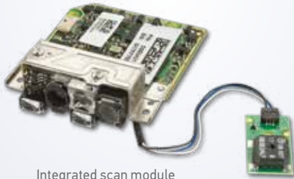
Integrated scan module DSE0421 / DSE0451